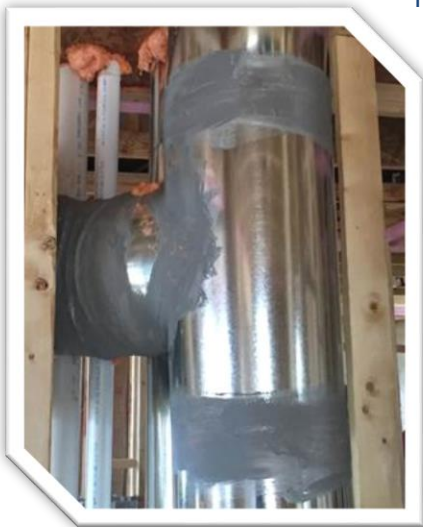
Ducts Sealed with Mastic